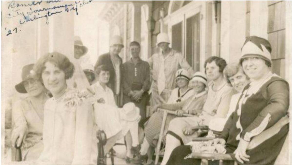
Charter members at Earlington G&CC in 1927.

The mission of the Washington State Women's Golf Association is to promote the game of golf, competition, and camaraderie for women, of all skill levels, who are members of recognized clubs within the WSWGA.