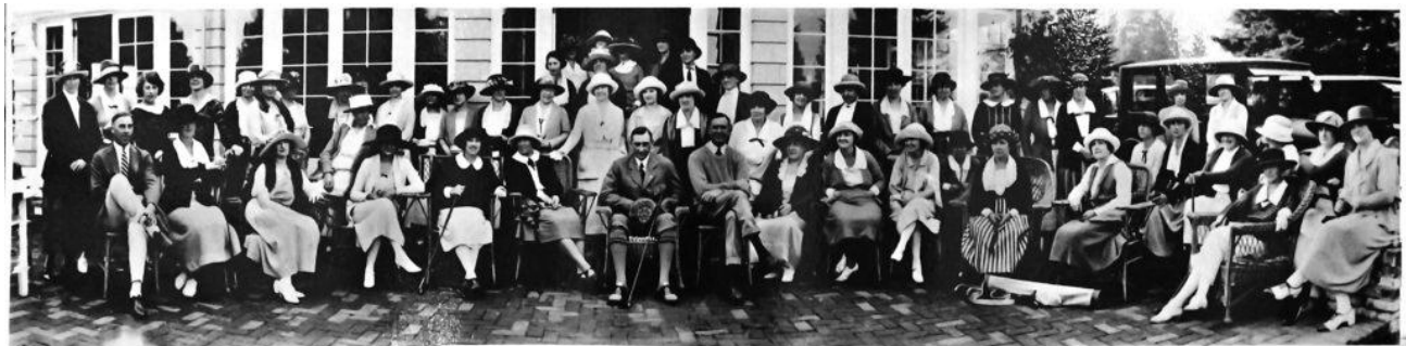
FIRST "W.S.W.G.A." CHAMPIONSHIP TOURNAMENT - GRAYS HARBOR - AUGUST 1922

The inaugural championship was held in August 1922, and following the first day of competition the WSWGA was formed. It was the first association of its kind in the state (pre-dating by a month the WSGA, which was founded in September 1922), and it was designed solely for women and managed exclusively by women.